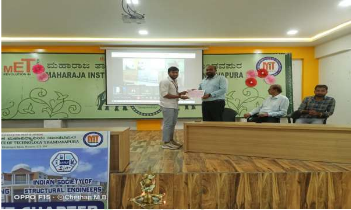
Issuing certificates to the enrolled students

Total number of attendees to the event: 95