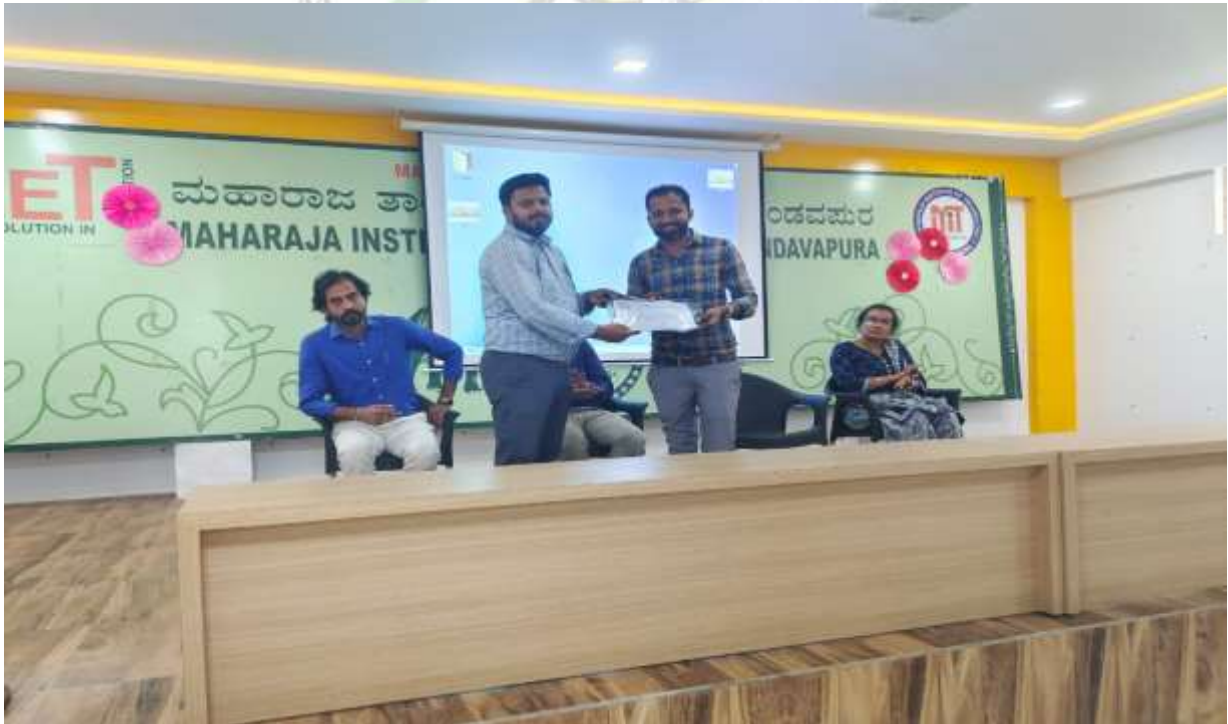
Hand-overing certificates to Head of the Department