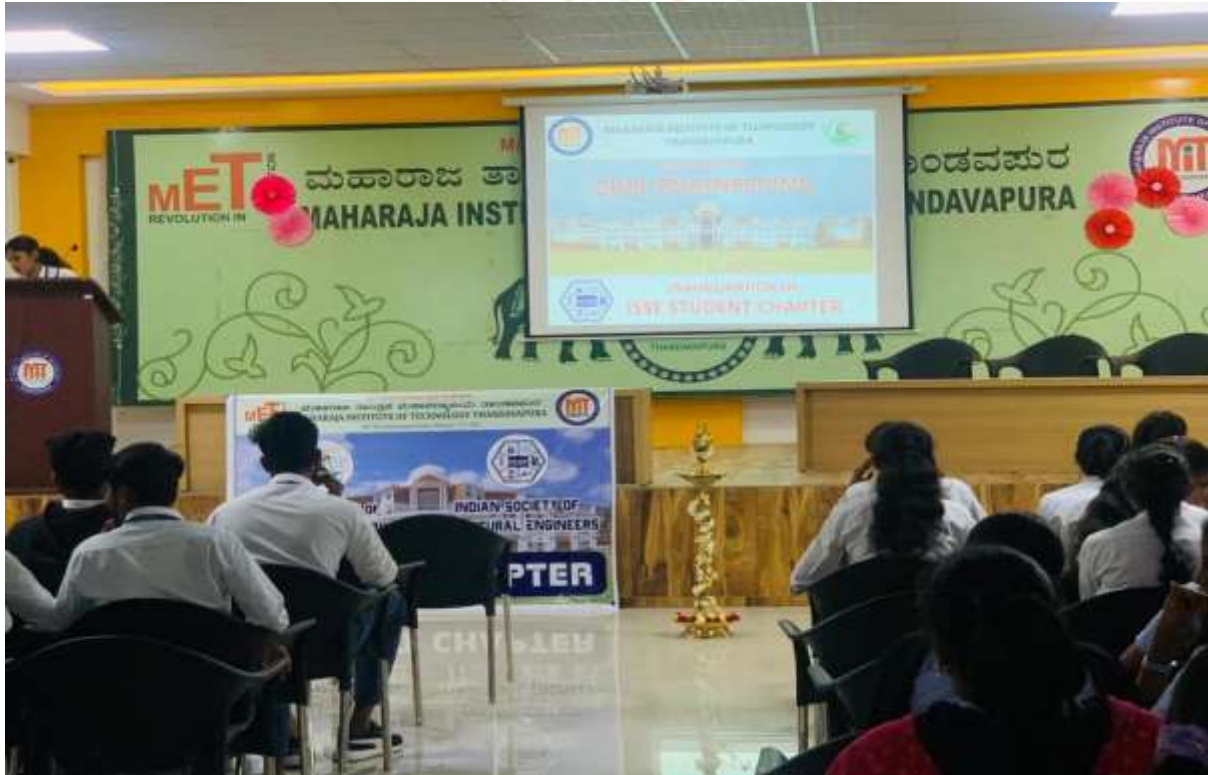
Inauguration of ISSE Student Chapter