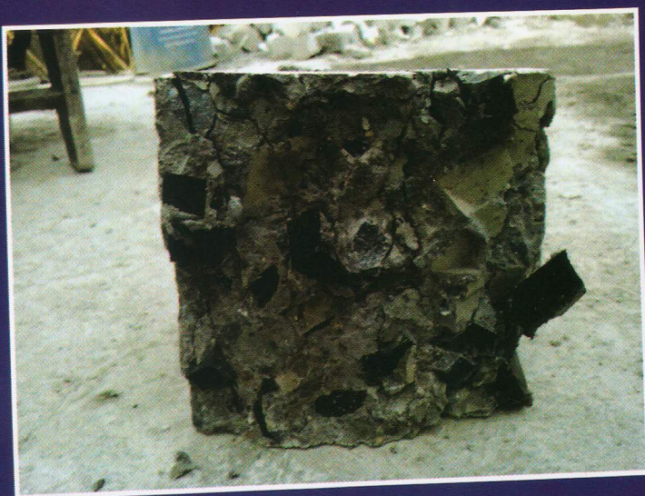
Waste Tyre Rubber Aggregates In Concrete See Page - 12